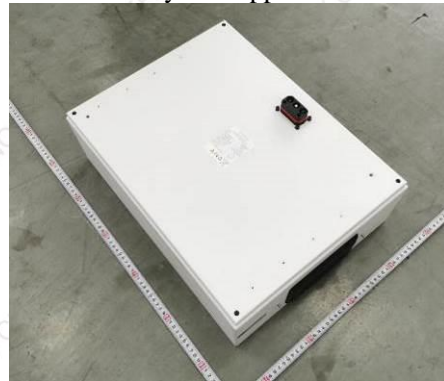
电池侧面外观 Battery side appearance