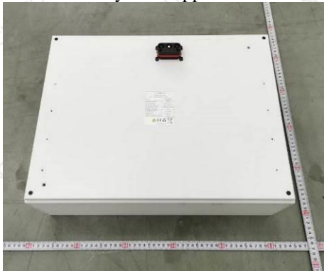
电池正面外观 Battery front appearance