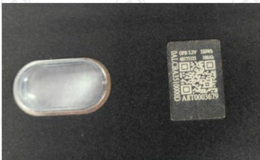
Figure 3 Cell label (电芯标签)